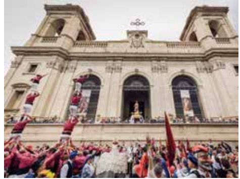
▲ Fotografia: Jordi Rulló