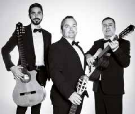
▲ Arrels de Menorca

7.30 pm. Plaça Sant Joan square Singing of "Havaneres" (contradance songs): BOIRA, ARRELS DE LA TERRAFERMA AND ARRELS DE MENORCA