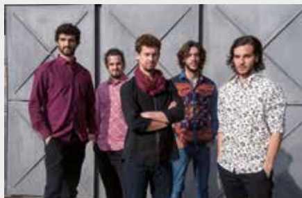
▲ Aurora2_