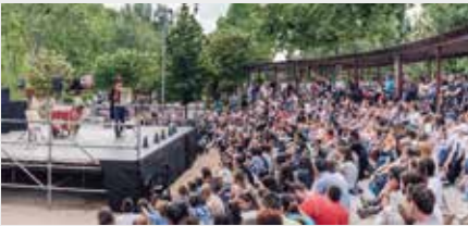
▲ Parc de Somriures (@Jordi Rulló)