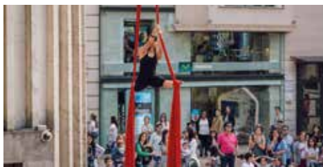
▲ Acrobacies INEF

An evening of dance and acrobatics with Club INEF