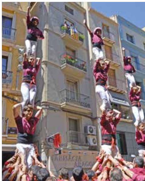
▲ Fotografia: M o Tresa Oliva Viladegut

Colla Vella dels Xiquets de Valls, Els Moixiganguers d’Igualada and Castellers de Lleida. →