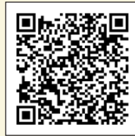
App Cultura Lleida