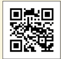
Web de Festes